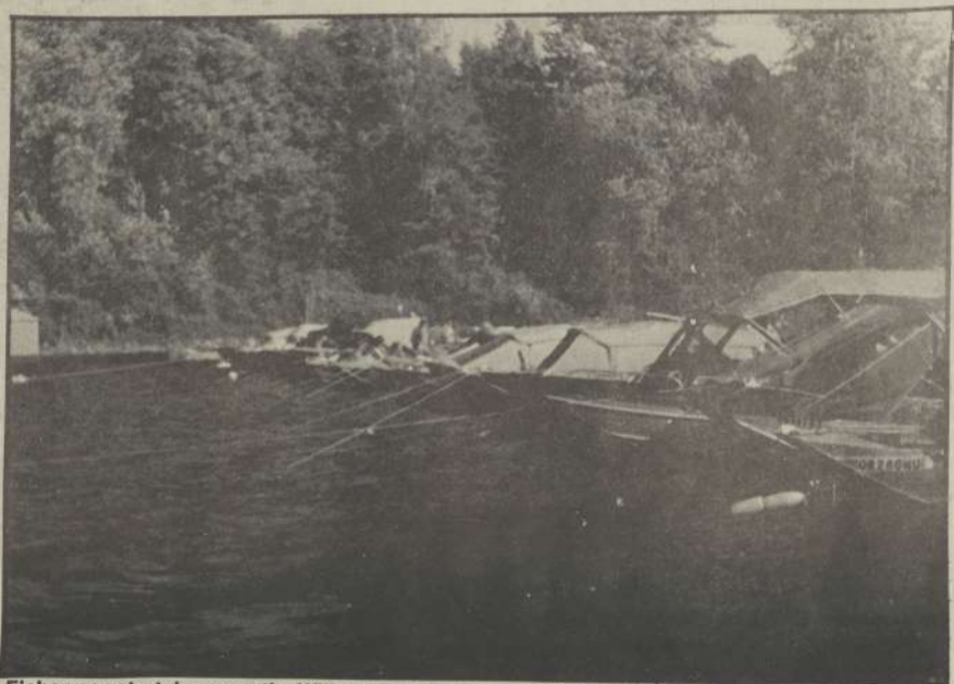
Fishermen stretch across the Willamette near Oregon City in a "hog line." Fishermen are the main source of debris found in the river.