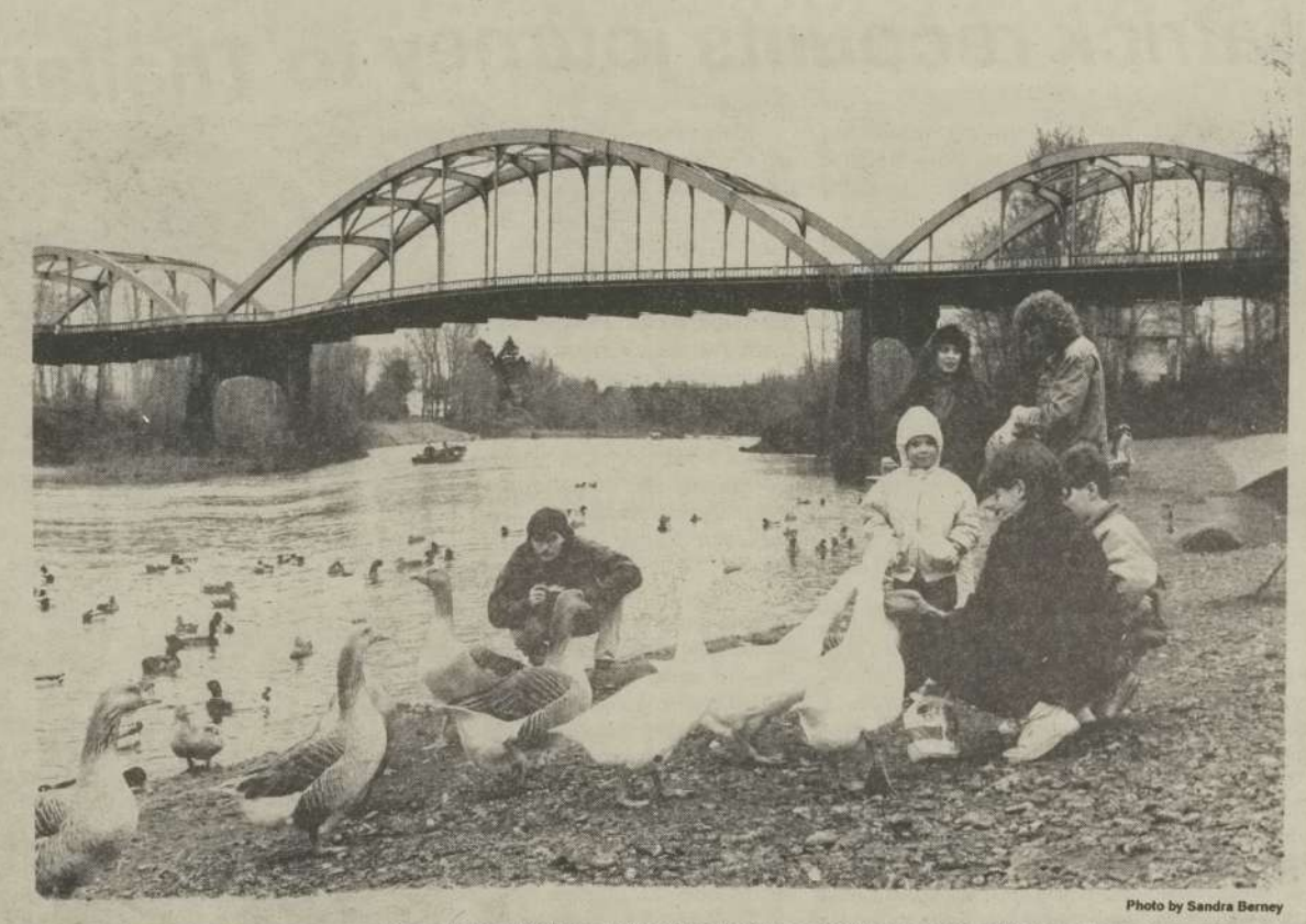
Chasing wildlife along the banks of the Willamette River, the class learns sometimes your subject refuses to cooperate.

Norther Strategies and some as a second state of the second