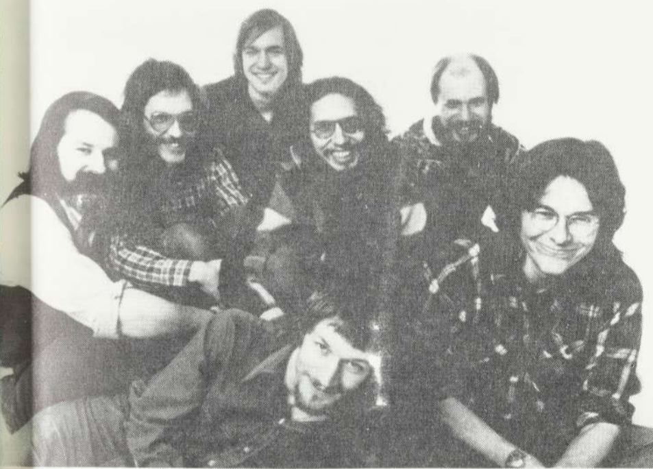
David Bromberg Band

Singer-songwriter Jimmy Buffett returns to the Paramount Theatre Friday evening Dec. 10 at 8 p.m. heading a star-studded bill which also features the multi-talented David Bromberg Band, and special guests the Little River Band.