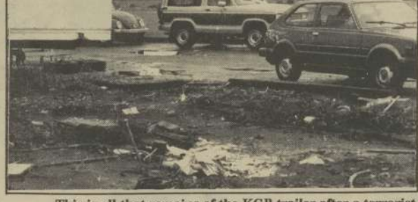
This is all that remains of the KGB trailer after a terrorist bombing by the Committee to Re-Elect Faith (CREEF).

away my AK-47 and they were bunch of party bigshots hostage the Bolshevik scum that in- and kill one of them a day until Faith is reinstated and these ridiculous charges on my friend would be more terrorist activity Ollie North are dropped," he