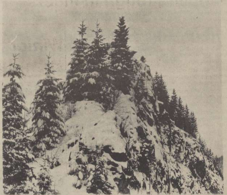
A glance and a prayer for the future, may we see the snow?