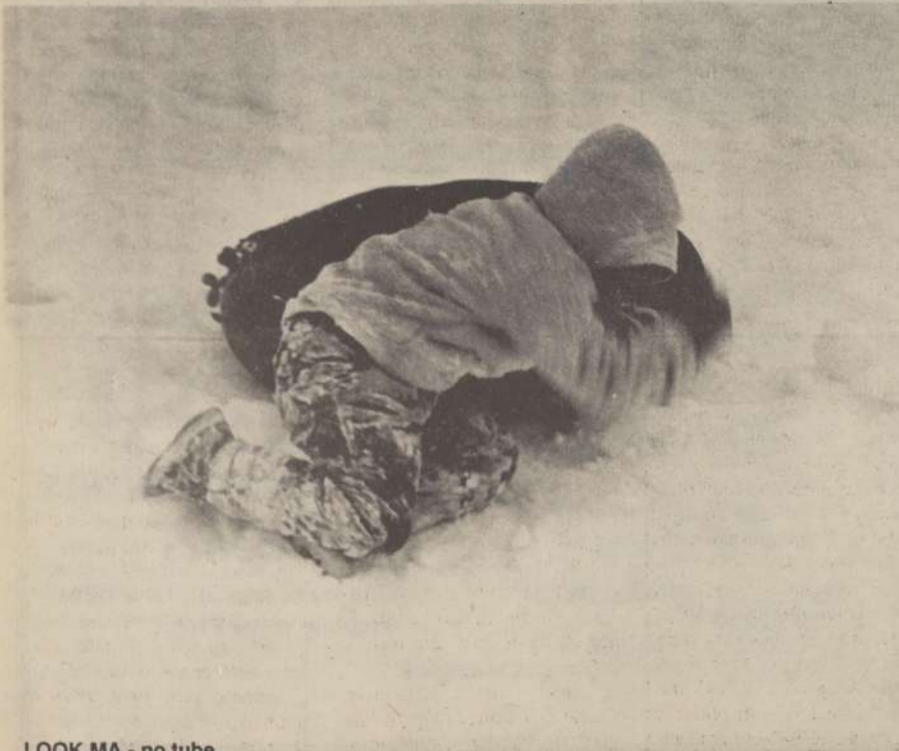
LOOK MA - no tube.