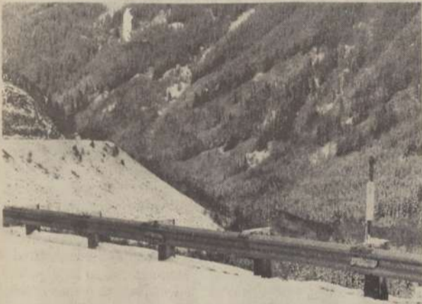
Mt. Hood takes a peak.