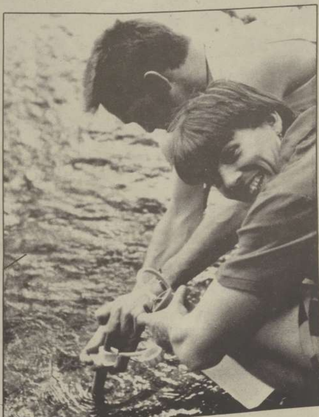
The water purification system.