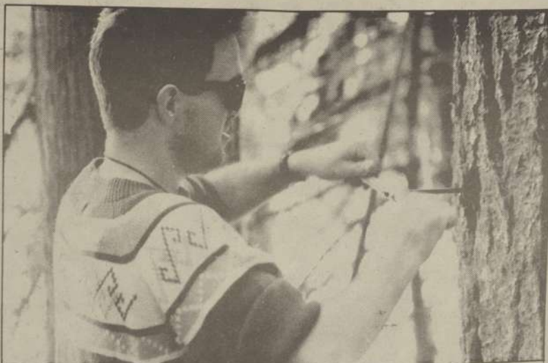
Honest tree... this won't hurt a bit.

The final hike for "Hike into Spring 1988" took students from CCC to the Lewis River near Mt. St. Helens in Washington. The overnight hike followed the river through old growth Douglas Fir, cedar and hemlock with numerous wildflowers blanketing the trail's edge. Highlights of the trip were the beautiful weather, the gourmet dinner competition, the evening campfire sing-along, and the morning's pancakes. Student activities included using an increment borer to determine a tree's age and estimate its general health, a demonstration on primitive fire starting skills, and discussion of management policies for old growth timber.