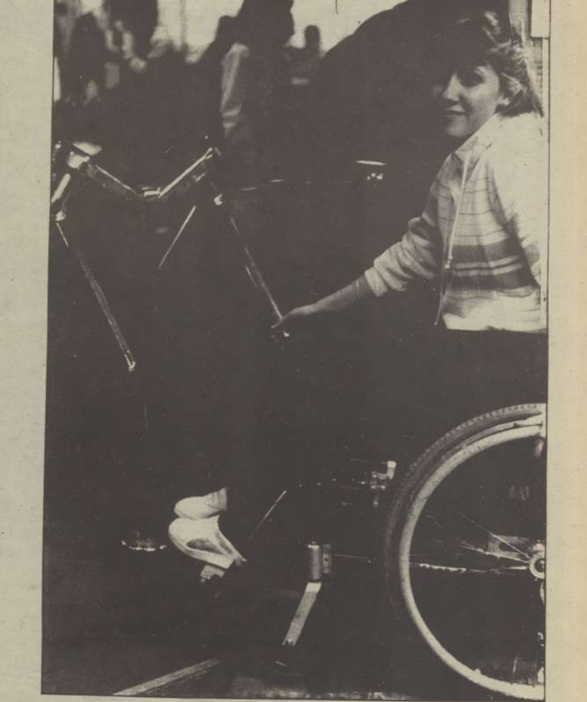
Turn stiles turn away handicapped students... The only entrance to Norm's is backward through the cashier aisles. That's impossible, explains Hoffman, with the crowds at lunch.