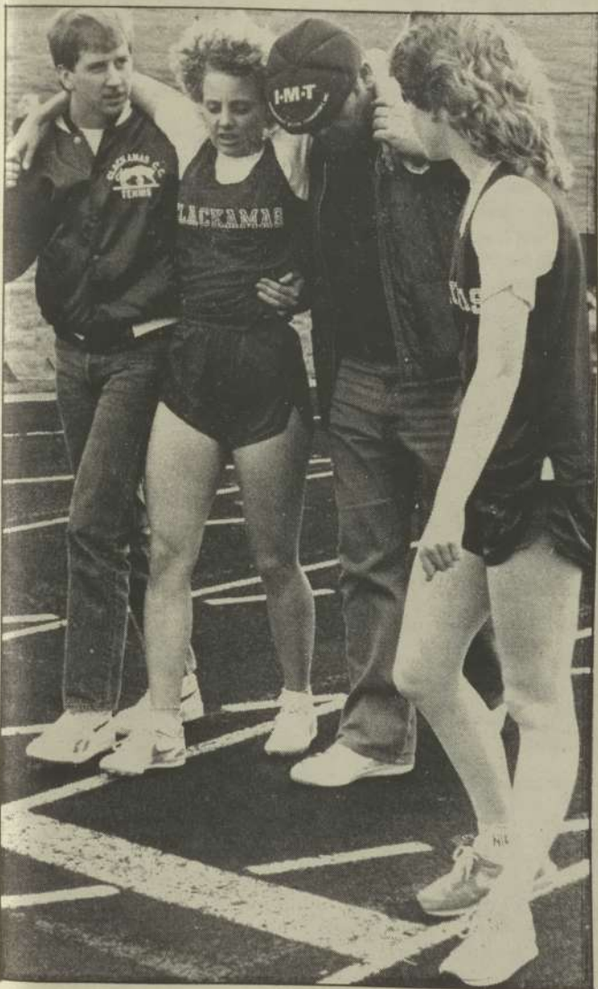
Cougar runner recovers from race.

Both the men and women will be back in action, getting ready for the state meet May 13-14 and the Northwest Championships May 27-28 in Spokane.