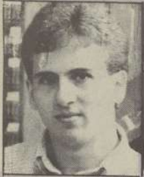
by Jerry Ulmer Staff Writer

the only one with any kind of national significance.