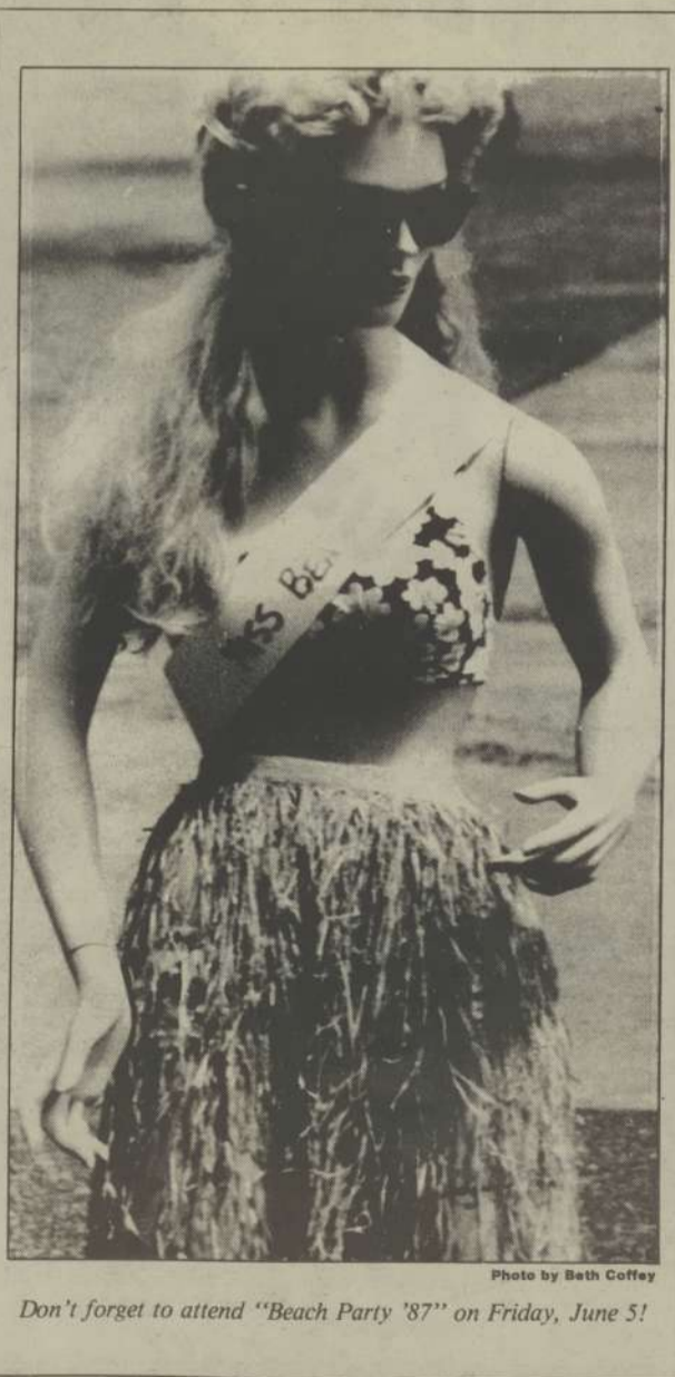
Don't forget to attend "Beach Party '87" on Friday, June 5!

Last, but certainly not least, is Vesuvius Day. August 24 marks the 2066th anniversary of the Mt. Vesuvius explosion that destroyed the entire city of Pompeii. This was a great day in the history of insurance companies. So, get a bunch of friend together and have a real summers end blow out! Don't forget to turn on your lava lights.