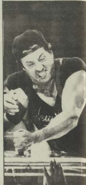
Sylvester Stallone - Recites profanity on new video cassette.