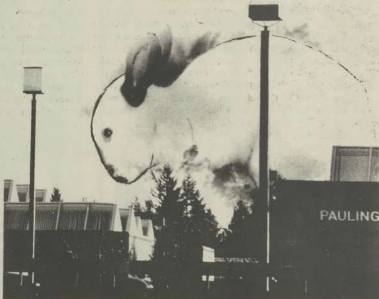
Following radiation poisoning one of the disguised skates slithers its way out from within Pauling 141's walls and devours the entire CCC campus, in addition to squashing several students and faculty members.