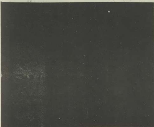
A group shot in a cavern filled with stalagmites and stalactites.

Spring Break, time for adventure! Not "Love Boat" adventure but "danger" adventure. That's right, I went spelunking! For those of you that are of a slower nature, that means cave exploring.