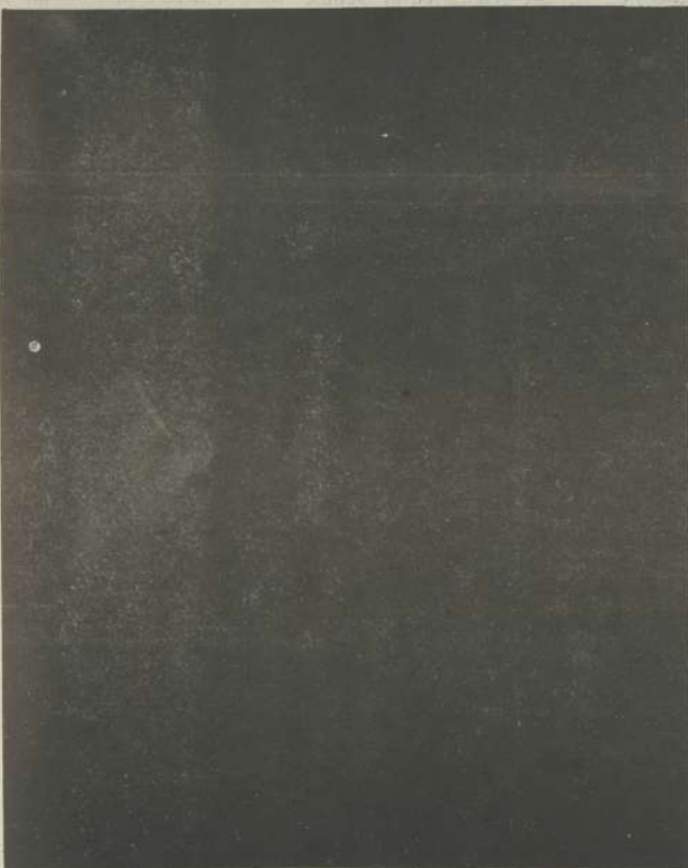
An underground river we found in the cave 'Spontaneous Dive.'