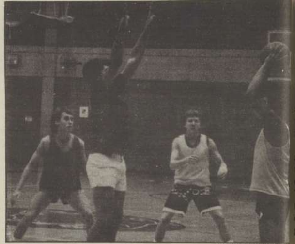
READY FOR ACTION- Members of the Clackamas men's basketball team practice in hopes of increasing their record to 20 tonight against Lane.