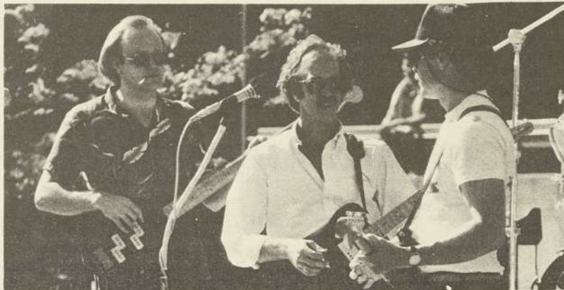
A BRIGHT AFTERNOON, a shining start-Clackamas Community College's new president shared the sunshine, music, volleyball, and picnic with a crowd of well-wishers that included staff, faculty and students.