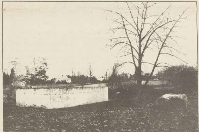
THEN AND NOW--ELC site (above) Below is completed tank that will be dedicated and christened May 11.