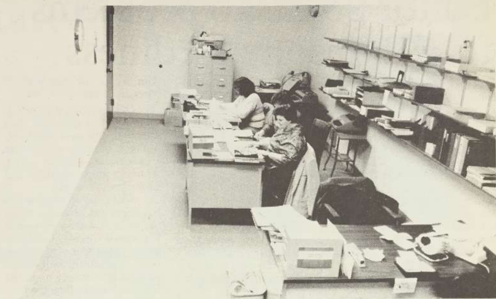
NEW AND IMPROVED — brand new office is situated in area where lunchroom was previously located in Barlow Hall.

"The timing was a little tight, but due to the fact the classes are all in one area, they will be able to interact," Fisher said. Fisher also said response from the remodeling has been "nothing but good"