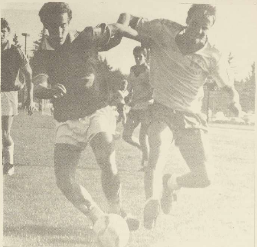
FLYING ELBOWS—Action got hot and heavy against Lewis & Clark. Cougars do battle with Seattle Pacific here today.