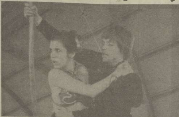
Luke (Mark Hamill) and Leia (Carrie Fisher) prepare to swing to safety from the top of Jabba's desert sail barge.

waiting for a sequel. The ending is complete and wraps up the middle of three trilogies. George Lucas plans on making nine films in all, and the familiar characters that we have come to know so well come to