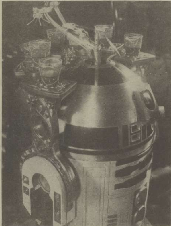
R2-D2 is turned into a waiter in "Jedi."

So get going, grab the popcorn, and be prepared to venture back a long time ago to galaxy far, far away.