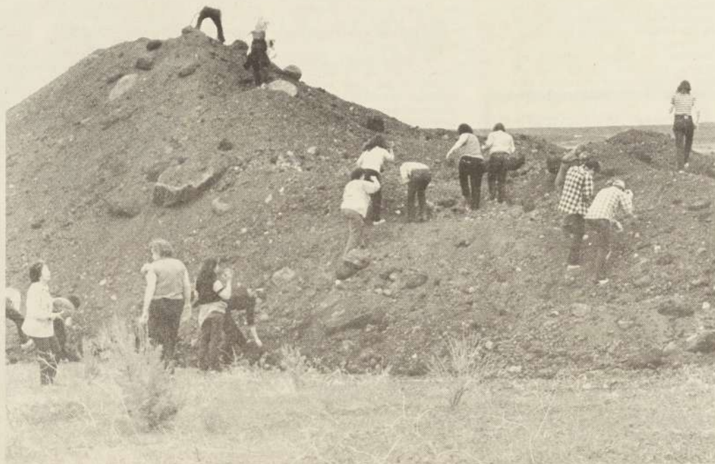
Students search for perfect rock. Due to the crystallization process, the hollowed-out magma had a rattle sound.