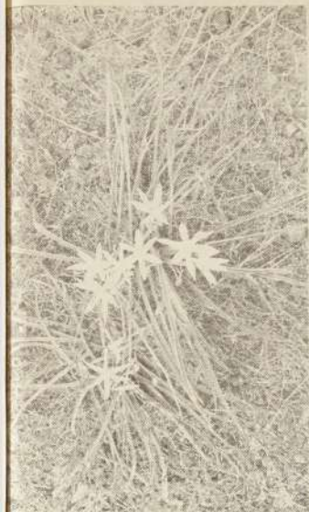
Lily, a very rare plant found at Malheur.