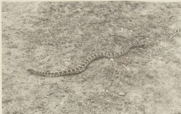
The Western Sage Rattlesnake is one of many found and Malheur National Wildlife Refuge.

Story and photos by Rick Obritschkewitsch