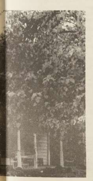
Wednesday, November 10, 1982