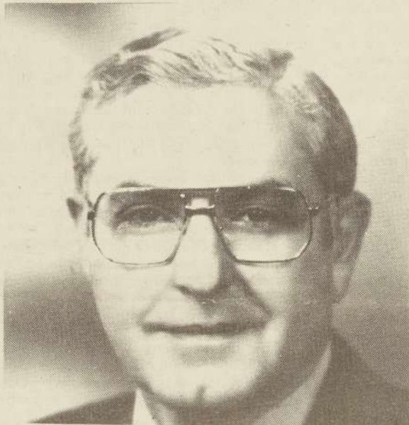
Governor Vic Atiyeh