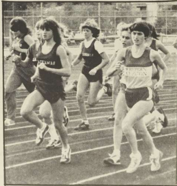
Women Cross Country runners near the start of last Saturday's Clackamas Invitational