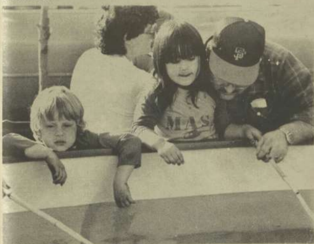
SLOW TIME: Father helps daughter hold pole and offers words of encouragement, while young fellow could care less.