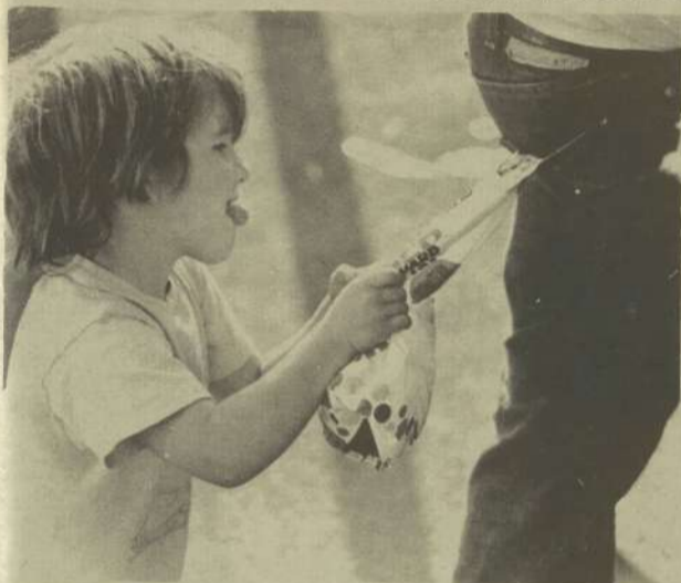
PICK POCKET: Youngster toys with his father's bread bagged trout.