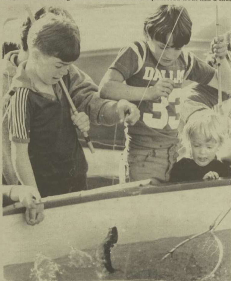
SHOCK AND SURPRISE: Struggling trout catches his captures off guard. Fish-a-thon was held last Saturday and Sunday at the Southridge Center Albertsons. Cost was $1.25 a fish.