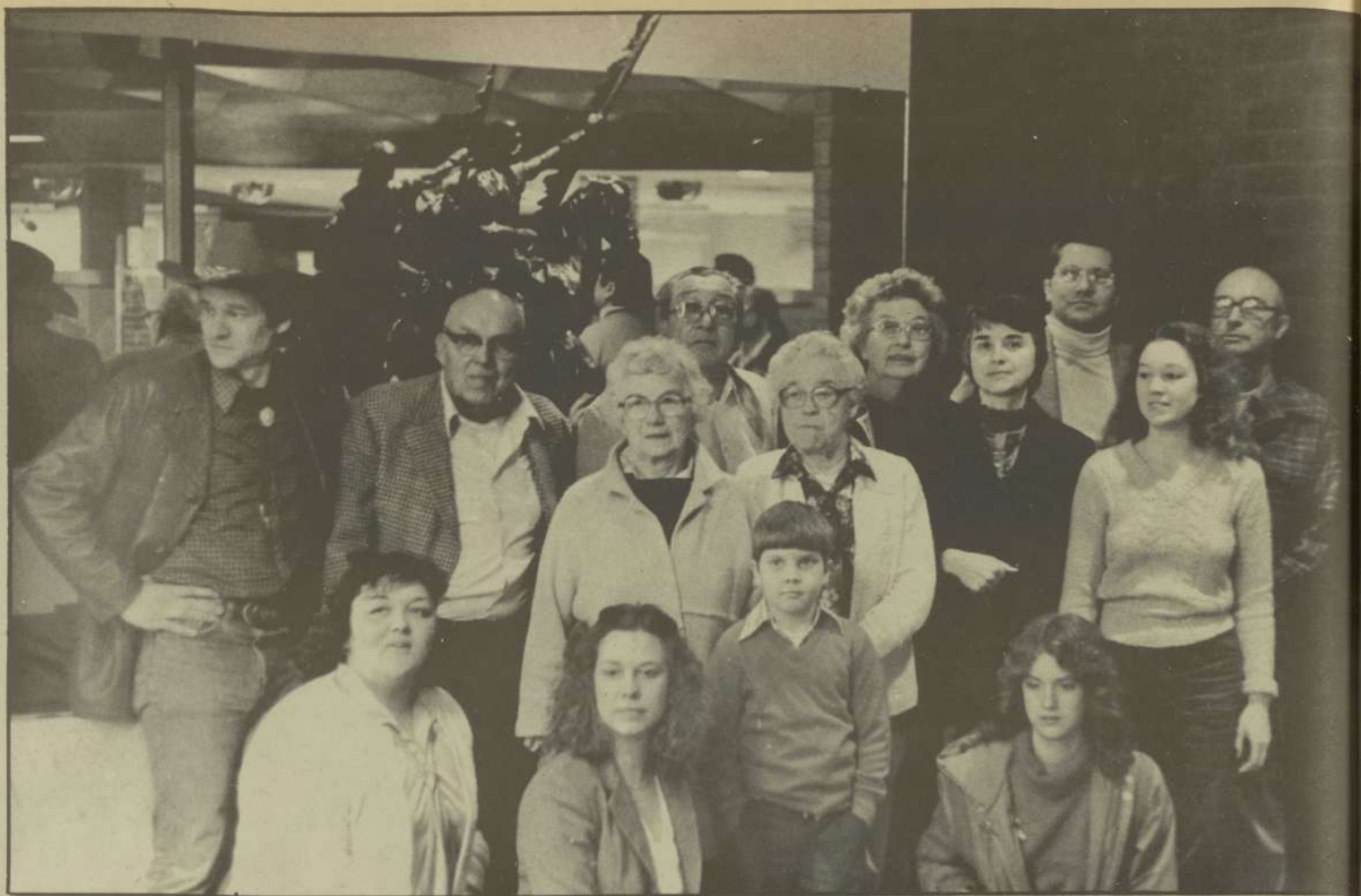
THE FAMILY MEEK: Members of the family were pleased with the sculpture and gladly stood for a picture with the statue of their relative.