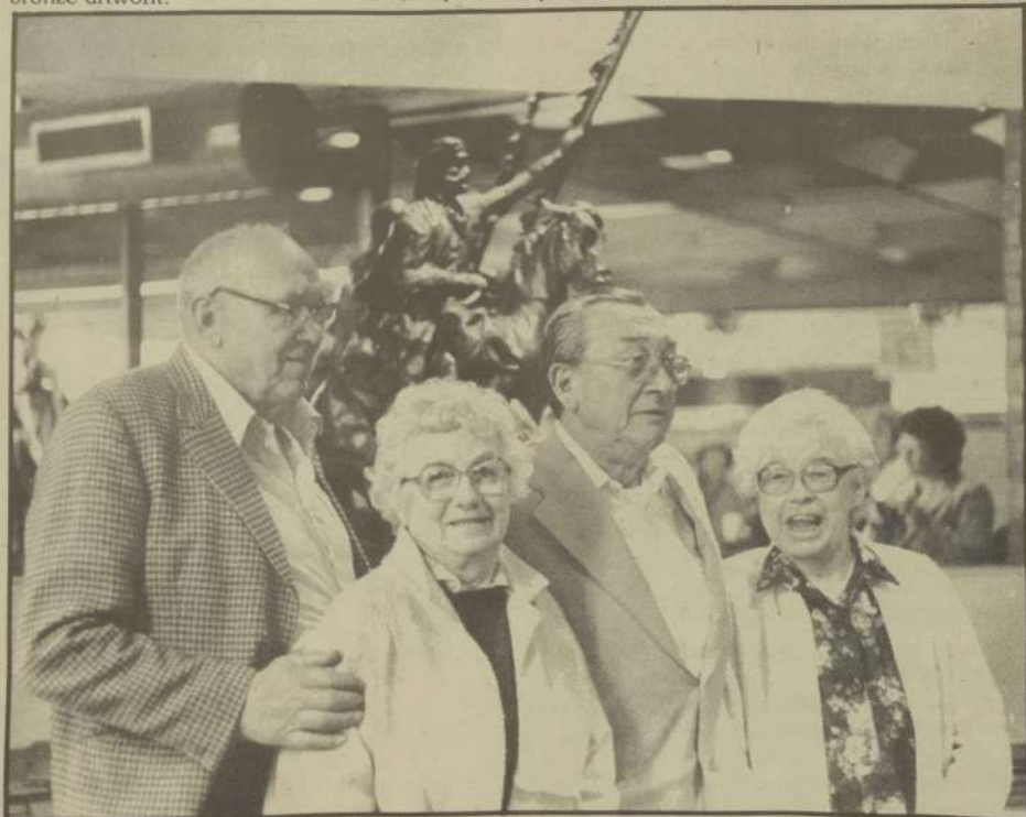
THESE FOUR GRANDCHILDREN of Joe Meek attended the official unveiling of the bronze sculpture.

The Joe Meek sculpture indeed thought provoking and a wonderful tribute to a truly inspirational man.