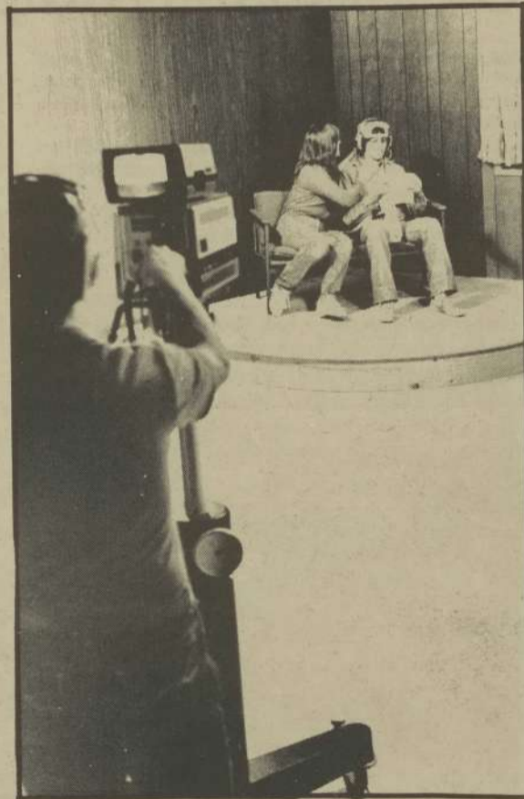
FROM THE VIEW of the cameraman the soap opera is rehearsed.