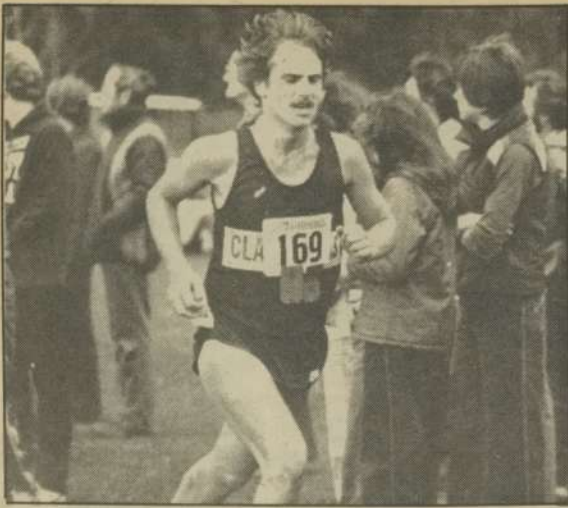
Clackamas runner heads for finish line.