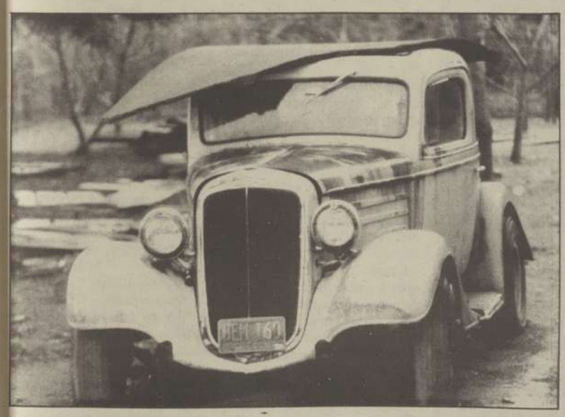
1936 Ford 2-window Coupe, Located 11/2 miles south off Beavercreek Road. Currently in the process of restoration.

1951 Chevy Sidepanel, Milwaukie, Oregon. Has original 289 6-cyl., with three on the tree.