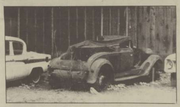
1929(?) Ford or Dodge Convertible. Stored in Canby, on a studebaker farm with approx. 200 other "rust buckets."