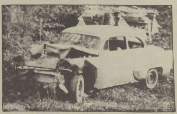
1954 Chevy Coupe. 13th Avenue, Oregon City. Being used to restore another similar car.