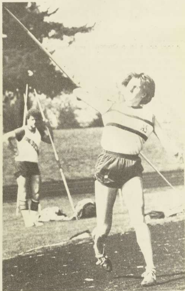
A Cougar spear-chucker cranks up to let one fly.