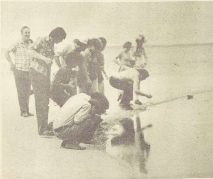
Clackamas Community College members examine "Bad water."