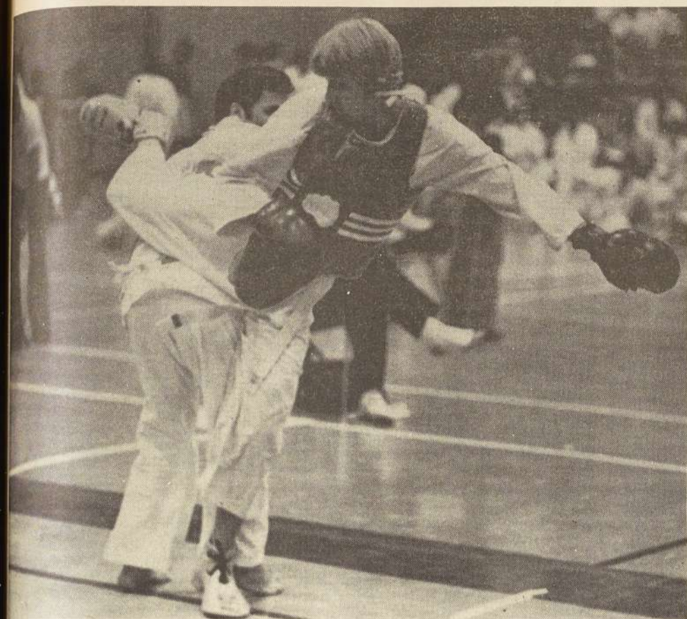
Area college students studying various styles of karate got a chance to use their skills at Lewis and Clark College last Saturday. A Tae Kwon Do Tournament was held in the college's gym and a few students from Clackamas were among the par-