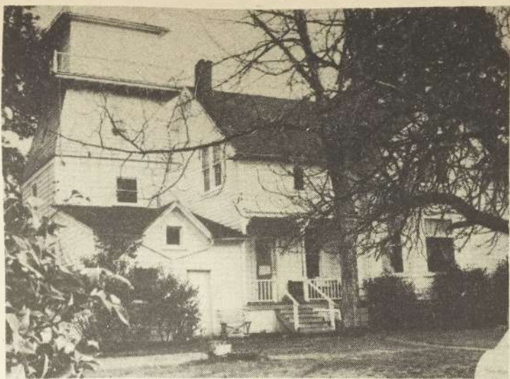
This marvelous old house has been divided into apartments as Boetje likes company more than extra room. Her living quarters are filled with antiques and souvenirs from both the old and new world.