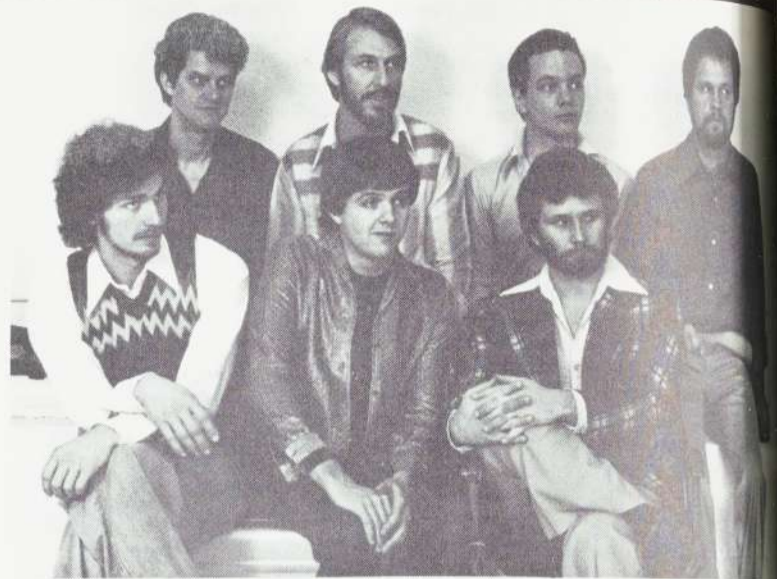
Upepo brings polyrhythm to CCC Saturday, Oct. 7, from 8 to 12 p.m. in the CCC Mall.

The ASG sponsored event will be Saturday, Oct. 7 from 8 to 12 p.m. in the Community Center Mall. Admission is $1 students and $2 general.