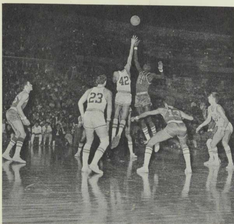
"Jump, jump, higher, higher, get that ball and go," was the yell as players await the outcome of the jump which signaled the start of the championship game against Madison last Saturday. The Generals grabbed the ball and jumped to a two point lead.