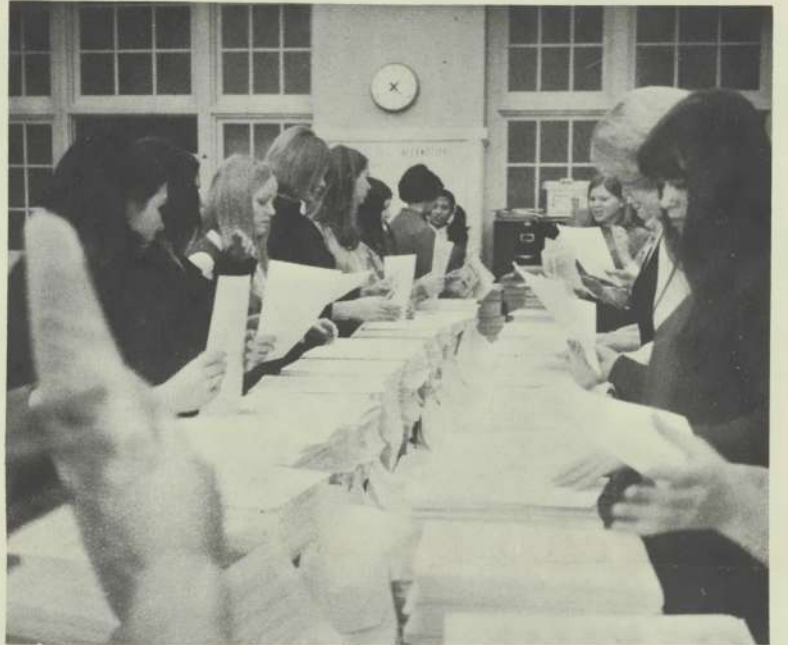
500,000 paper airplanes? Female members of the student body work hastily to assemble forecasting booklets in the counseling office.