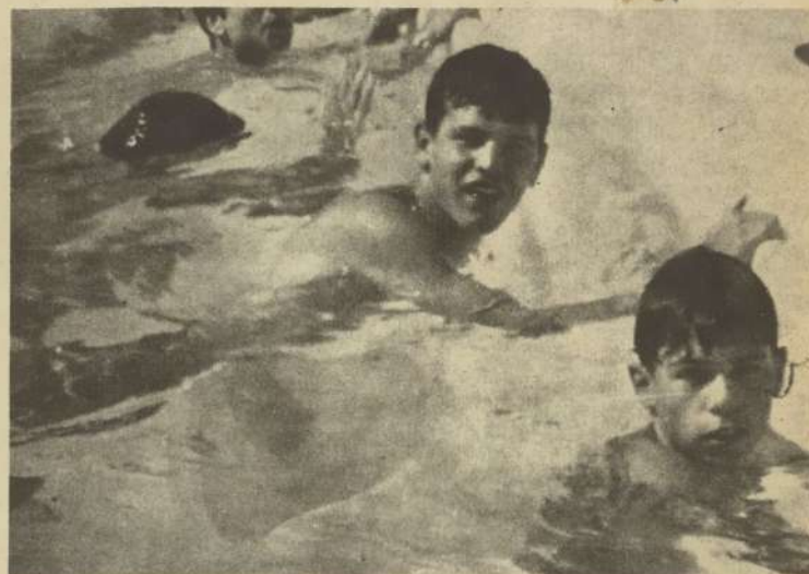
PHYSICAL EDUCATION students rest on side of pool after warm-up drill. Swimming is held every other day in gym classes for the first time. The pool is being rented on an experimental basis from the Park Bureau.

Pride in yourself, Pride in your school, Pride in your team.