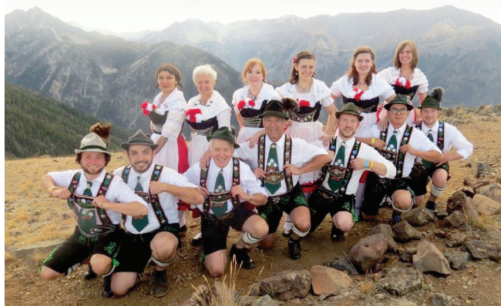
The Tirolean Dancers