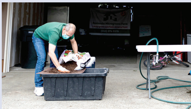
Mixing soil before planting microgreens