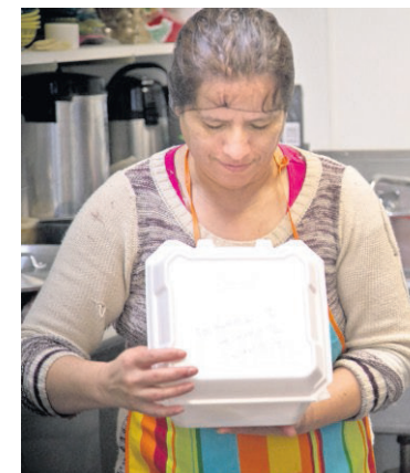
Macias wrapped up a to-go order for a customer on her first official day or business on March 13.