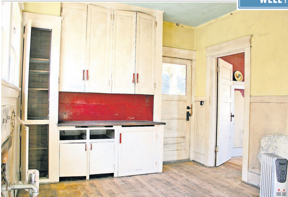
The kitchen has original cabinetry including a California cooler.