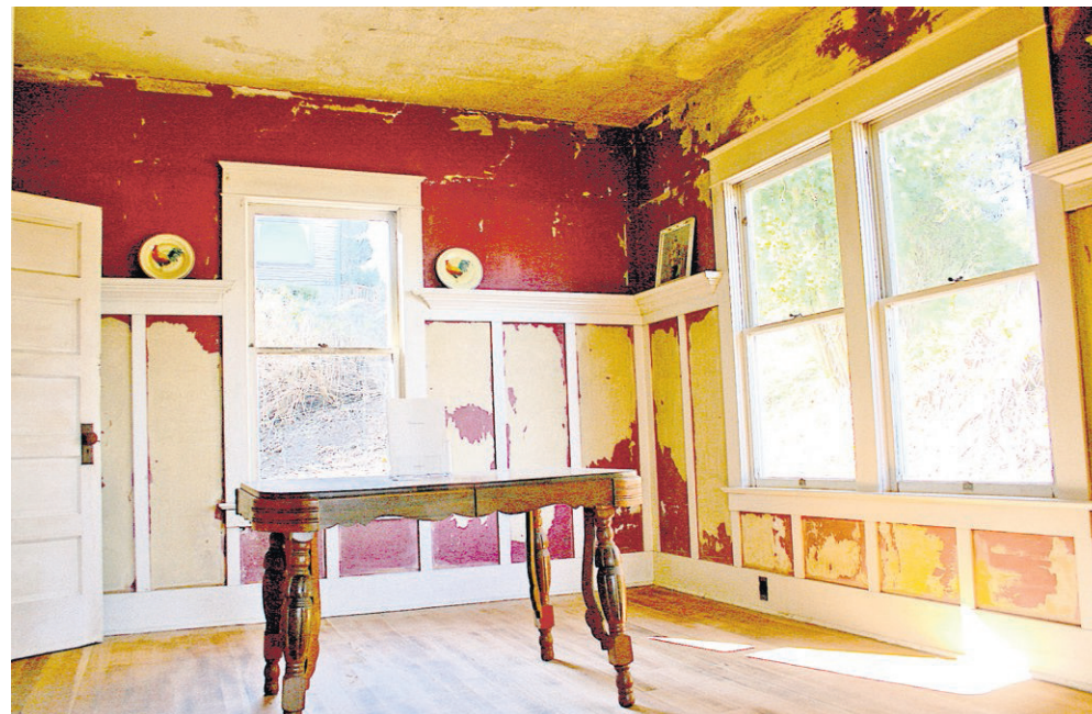
The dining room is wrapped in wainscoting.