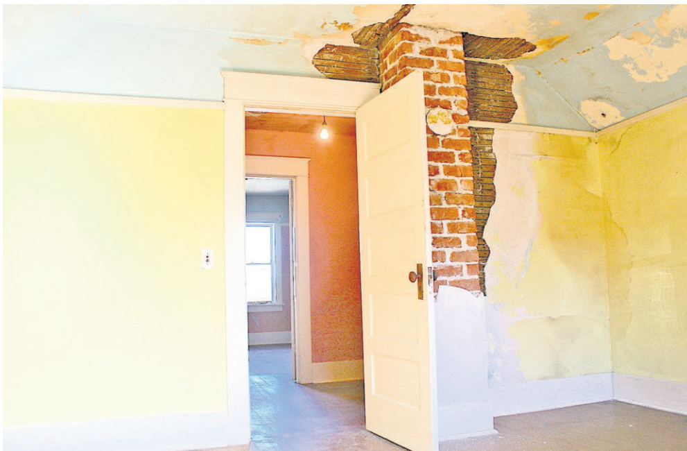
Rain once poured into the house and damaged interior plaster.