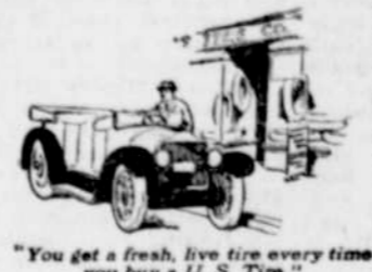
"You get a fresh, live tire every time you buy a U. S. Tire."

A sound reason for the fact that you see more U. S. Tires on more cars than ever this year.