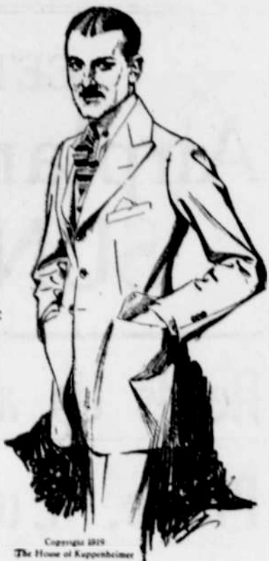
Copyright 1919 The House of Kuppenheimer