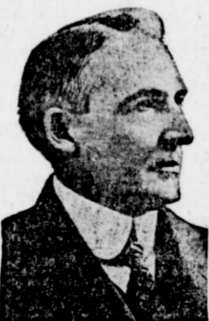
WARREN G. HARDING

After the temporary organization headed by Senator Lodge as chairman was made permanent the republican convention marked time during the