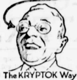
The KRYPTOK Way

You can't afford to economize in the care of your eyes beyond the point of safety. If you are troubled with poor vision, consult with us as to how it can be best improved. A consultation will place you under no obligation.