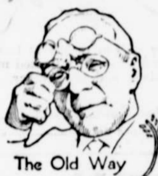
The Old Way