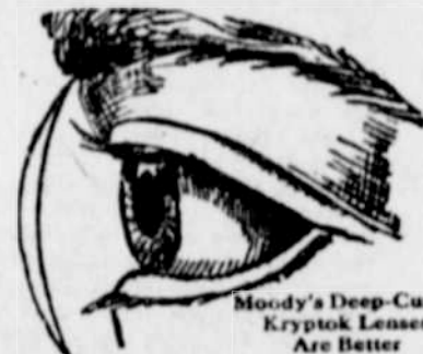
Moody's Deep-Curve Kryptok Lenses Are Better

My most valuable asset is the good will of persons whom I have served. Most of my patronage comes through their recommendation of my services to their friends.