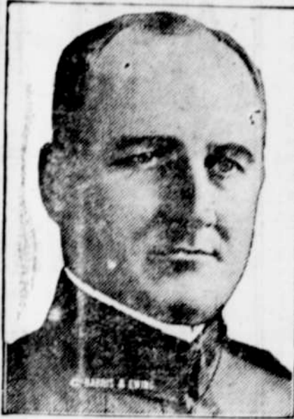
Brigadier-General James G. Harbord, who is commander of the United States marines fighting in France.