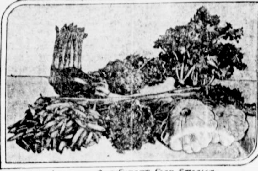
HELP INCREASE OUR EXPORT FOOD STOCKS