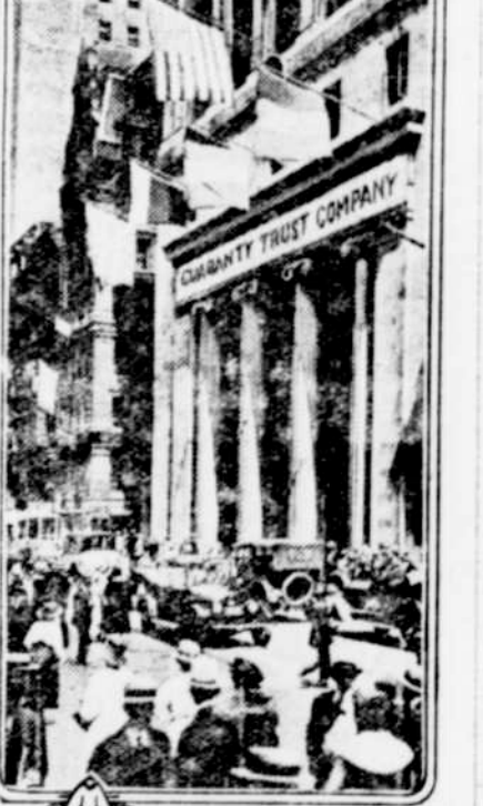
New York City's Financial District Decorated in Honor of a Foreign War Mission.

The growth of international finance has made the world's aggregate of closed days a serious factor and an expensive one. Not until now, how-