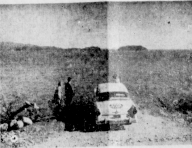
Gover point, one of many spots on "Sunshine coast" where salmon abound, is pleasant pause for white motorlog car.

A pleasant 15-mile trip along Marine drive, which winds through a lovely shoreline residential district, ends at the ferry slip at Horseshoe bay.