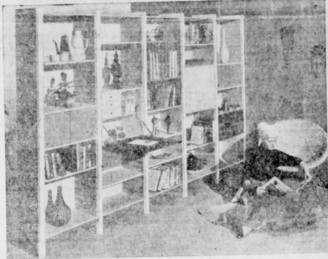
The unit storage wall is the name for this beautiful interior stud-partition treatment. Most interior stud-partitions occupy valuable space, but this storage wall has been designed to utilize that space into many attractive and usable storage spaces. Texture One-Eleven (grooved plywood) has been adapted to support shelves so that they can slide into grooves at varying and usually adjustable heights.