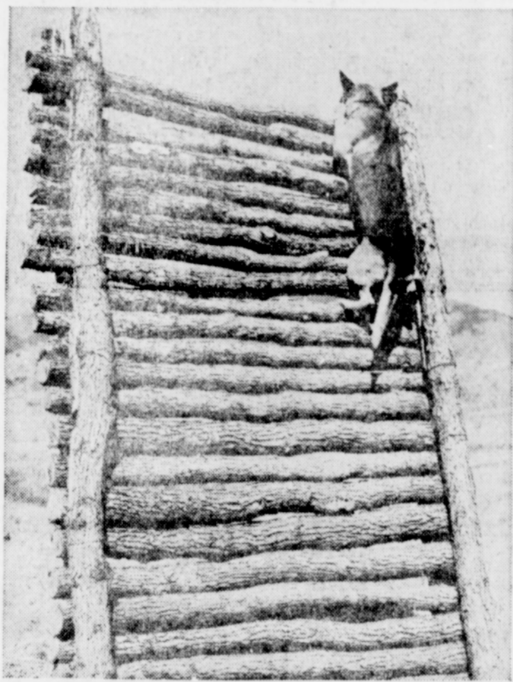
OVER THE TOP—"Tony," an Army sentry dog, tops a long wall during his "basic training" at the Army Dog Training Center, Fort Carson, Colo. This kind of thing prepares Army dogs for any terrain obstacles that might be encountered in combat. Sentry dogs often replace men assigned to protect expensive equipment.