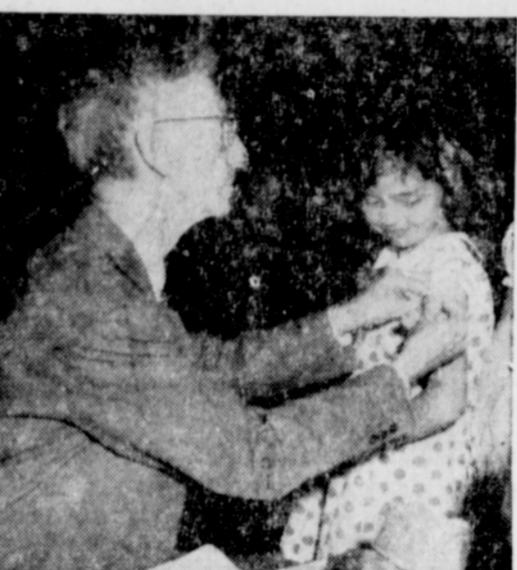
It's all over and it didn't hurt a bit! Salk vaccine makes this little girl safer now from paralytic polio. And her parents feel better too!