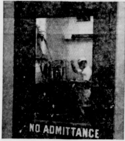
This technician is filtering dead cells and all other foreign matter from polio virus after it has grown on animal tissue in glass containers.

For the first time in history, a vaccine is protecting millions of human beings from paralytic polio. While the Salk vaccine will not work in every case, American children are being safeguarded against the dread disease, with no more risk than they would take in a vaccination against smallpox or a typhoid shot. The Salk vaccine must pass elaborate tests under the watchful eye of a government inspector at every stage of production. Then the final packaged vaccine is approved by the U.S. Public Health Service for distribution. Here are shown a few of the steps that assure American parents their children are being given a safe vaccine.