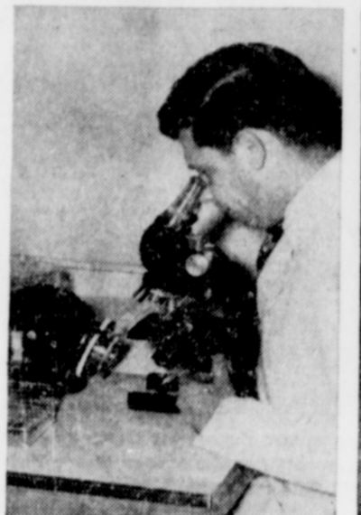
This expert is examining tissue after contact with vaccine, to determine absence of live virus.