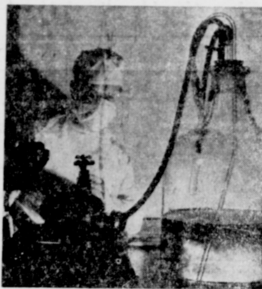
Virus is "cooked" in tank with formaldehyde (from bottle) until it is rendered harmless, after which it must pass exacting safety tests.